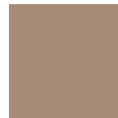
Hanson Trail Dust