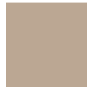
Hanson Desert Tan