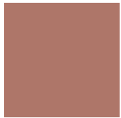
Hanson Colony Red